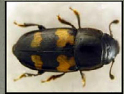
Nitidulidae species of beetle implicated in transmitting Oak wilt disease.

Having been a volunteer at the Seno K/RLT Conservancy (formerly Seno Woodland Management Center ) for about two decades, I recognize that, at times, we keep fighting recurrent insults to our forestry stands. We now have an oak wilt pocket in our Northwest woods, which has a very nice composition of walnut, red oak, black cherry, and a few white oaks. This area was clearcut in 1978 according to Elvira Seno's records, producing a phenomenal harvest of 98,000 board feet of lumber. This forestry stand of hardwoods has regenerated quite nicely, growing vigorously, exhibiting the tallest, straightest, majestic trees on the property.....until September 2003, when perhaps a Nitidulid or Picnic beetle with fungal spore on its legs, was attracted to the sap of a recently injured red oak, thus infecting the tree upon contact.