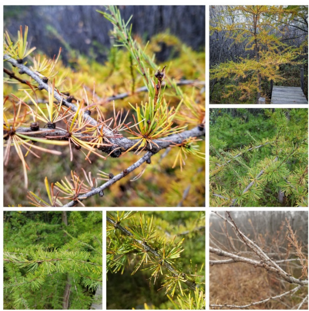
Our Tamaracks through the seasons.

It is all about climate resilient sites and empowering land trusts by providing them with the resources, training and tools to incorporate climate science into their plans for land acquisition and management plans. What is a climate resilient site, you may ask? A climate resilient site contains the following characteristics: physical diversity, local connectedness, regional connectivity and an intact biological condition. Physical diversity means landform diversity as in varying topography. Local connectedness refers to the ease of species movement within that topography. Regional connectivity is the flow within and between the various land forms on the site. Biological condition is concerned with the degree of ecosystem disturbance. The more resilient a site is, the less vulnerable it is to flooding, drought and species decline.