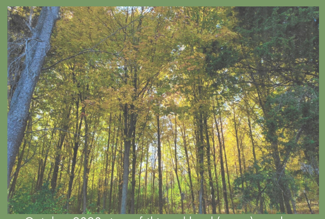
October 2020 view of thinned hard (sugar) maple woodlands at Seno K/RLT