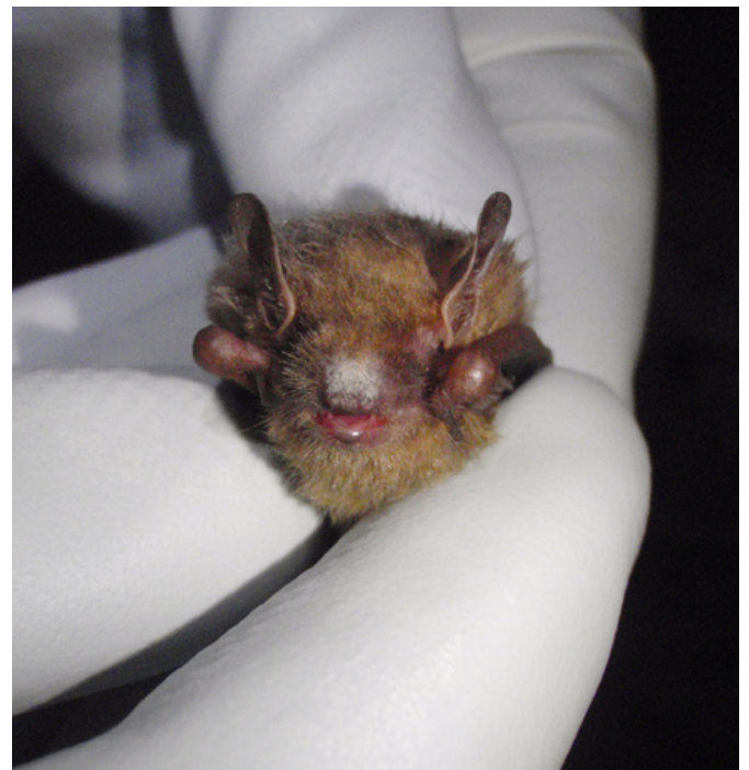
Tricolored bat with white-nose syndrome.