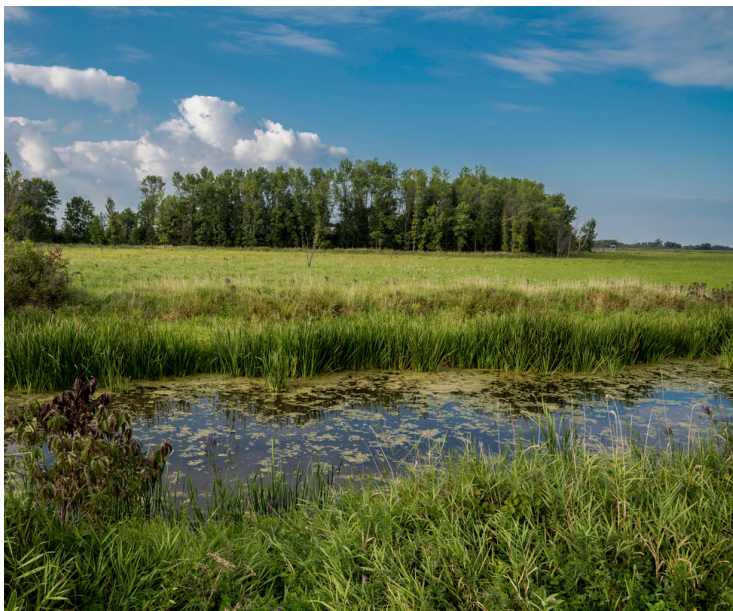
Horicon Marsh Wildlife Area