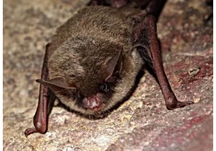
Northern Long-eared Bat

Landowners that have roost sites are key to assisting with the protection of bats, by protecting critical roosting site habitats and limiting disturbances to sites of hibernation. These sites where bats hibernate are called hibernacula, and if stumbled into in winter those intruding can wind up waking bats from torpor. Bats in torpor reduce their metabolism and body temperature to extremely low levels that require far less energy. Interrupting torpor costs them some of that precious energy needed to get the bats through until spring. This is another way that the fungus that causes white-nose syndrome has devastated bat populations across North America, causing bats to interrupt torpor and burn through the fat and energy reserves they need, on top of injuries directly from fungal infection.