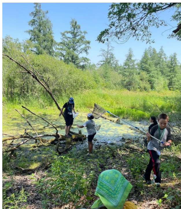
Explorers of our Seno Woodland Center Tamarack Bog

Where marshes are dominated by herbaceous plants species, swamps are largely home to dense woody vegetation and standing water. They are typically found in low-lying areas and can be either freshwater or saltwater.