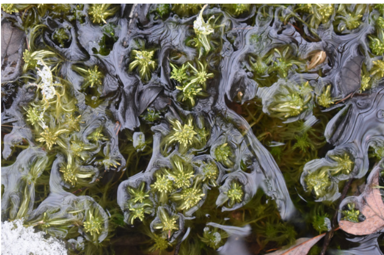
Frozen sphagnum moss in Seno Woodland Center's bog winter