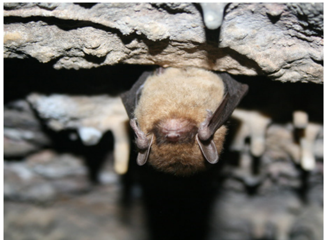
A little brown bat hanging upside down in a cave.

Bat habitat use often changes over the course of the year, and varies depending on whether the bats are reproducing females or not, but many of the native bats in Wisconsin are forest-dwelling bats. Little brown bats and big brown bats commonly roost in human-made structures but can also be found in the summer under tree bark, in rock crevices, and in tree hollows. They prefer mature old-growth forests for roosting and share this preference with many of the other native bat species of Wisconsin. Dead trees, called snags, are often a prime choice for roosts with their peeling bark and other hollow crevices. In winter bats move to caves, cliffsides, and mines to hibernate. As always there are exceptions though! Eastern red bats ( Lasiurus borealis ), for example, burrow into leaf litter for the winter. During these journeys between roosts, edge habitat (areas where woodlands and open prairies or fields meet) is integral. Not only does edge habitat allow for safer travel as it protects them from predators and wind, but such habitat also often has an abundance of food. In fact, woodland edge habitat is the preferred habitat for the tricolored bat, especially if near a body of water.