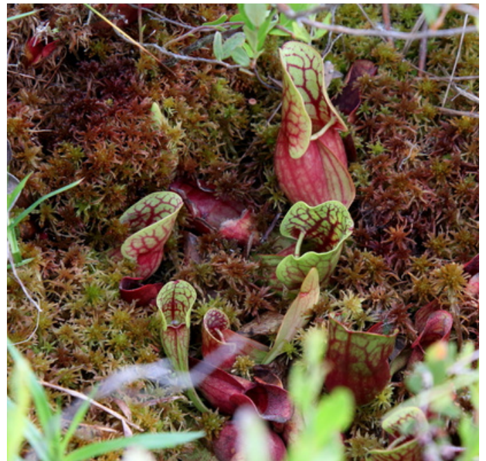
Pitcher plants & Sphagnum Moss

Carnivorous plants have adapted to thrive in these nutrient-deficient environments via insects and other small organisms rather than absorbing nutrients through the soil like other plants! Southeast Wisconsin is home to a few bogs, including the Cedarburg Bog State Natural Area and portions of the Kettle Moraine State Forest.