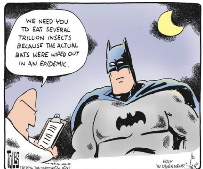
Cartoon by Tom Toles, Washington Post