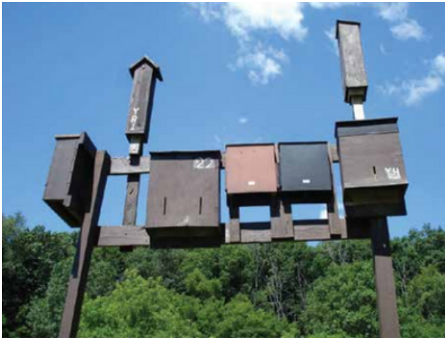
A variety of types of bat houses